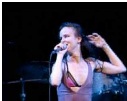
M.I.A., vive la fete. Juliette lewis. Lady Gaga. Roisin Murphy. Robyn. You...